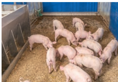
Continuous solid floor with bedding: ideal for rooting

Additional organic manipulable material can be offered via a hay rack, for example. The Havito® welfare barn concept perfectly meets the natural needs of pigs, such as resting, eating, rooting, defecating and urinating.