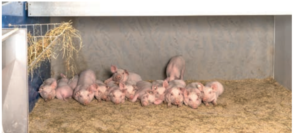
The climate cover creates a comfortable temperature in the resting area

Additional organic manipulable material can be offered via a hay rack, for example. The Havito® welfare barn concept perfectly meets the natural needs of pigs, such as resting, eating, rooting, defecating and urinating.