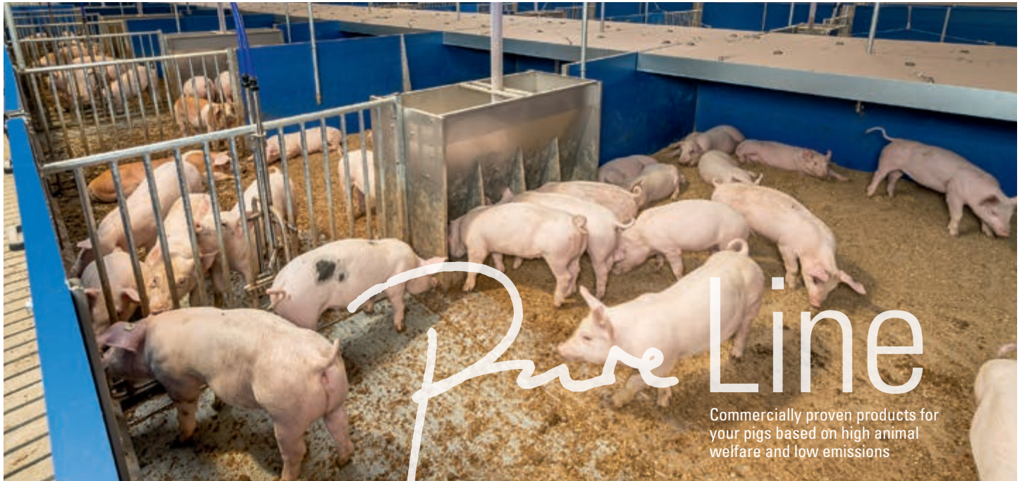
Havito® barn: wean-to-finish system without slurry channels or slatted flooring

Havito® was developed through the close cooperation between Big Dutchman and feed producer Bröring. Let our experts advise you comprehensively about this and other housing concepts from our PureLine product range.