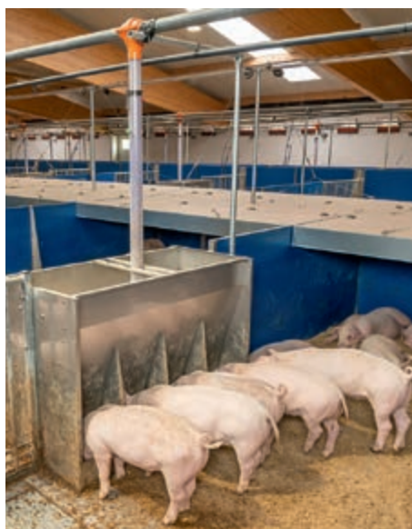
MultiMax ad libitum dry feeder

Nipple drinkers at different heights and drinking bowls make sure that the pigs have access to sufficient amounts of water at all times. To ensure that the solid floor remains dry, the drinkers should be installed near PigT. Any excess water can then drain off into the urine collecting pan.