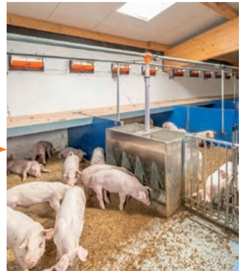
Fresh air enters the barn uniformly: no draughts