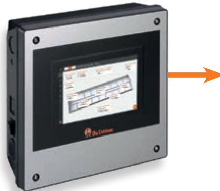
310 pro climate computer

The climate in the barn is controlled by our 307 pro or 310 pro climate computer.