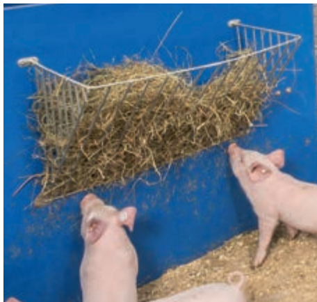
Hay rack dispensing roughage