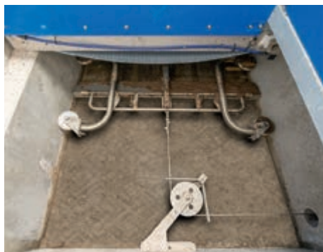
Manure removal with scrapers