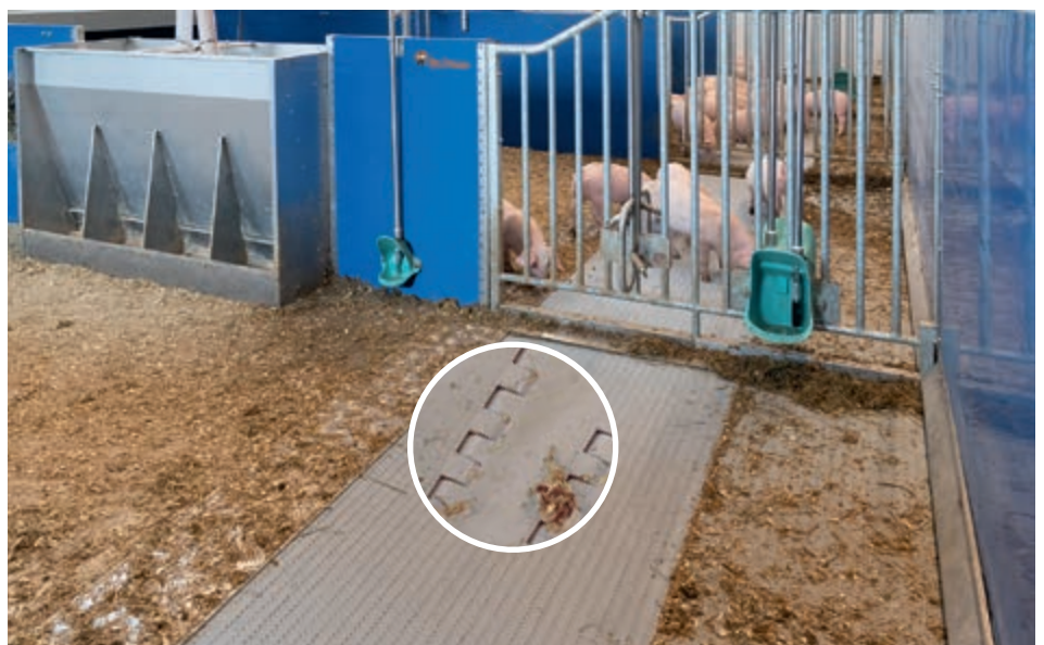
Continuous solid floor with connected PigT pig toilet, which removes faeces from the pen

stimulating them to defecate in this spot.