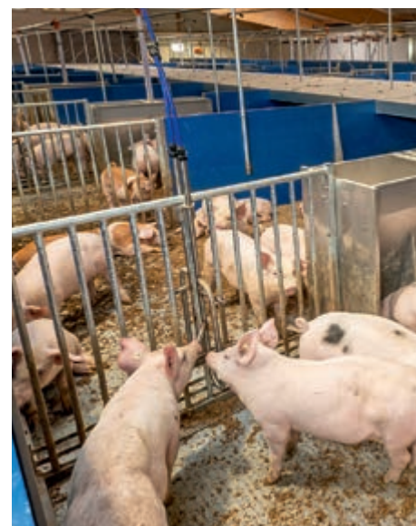
Nipple drinkers installed above PigT